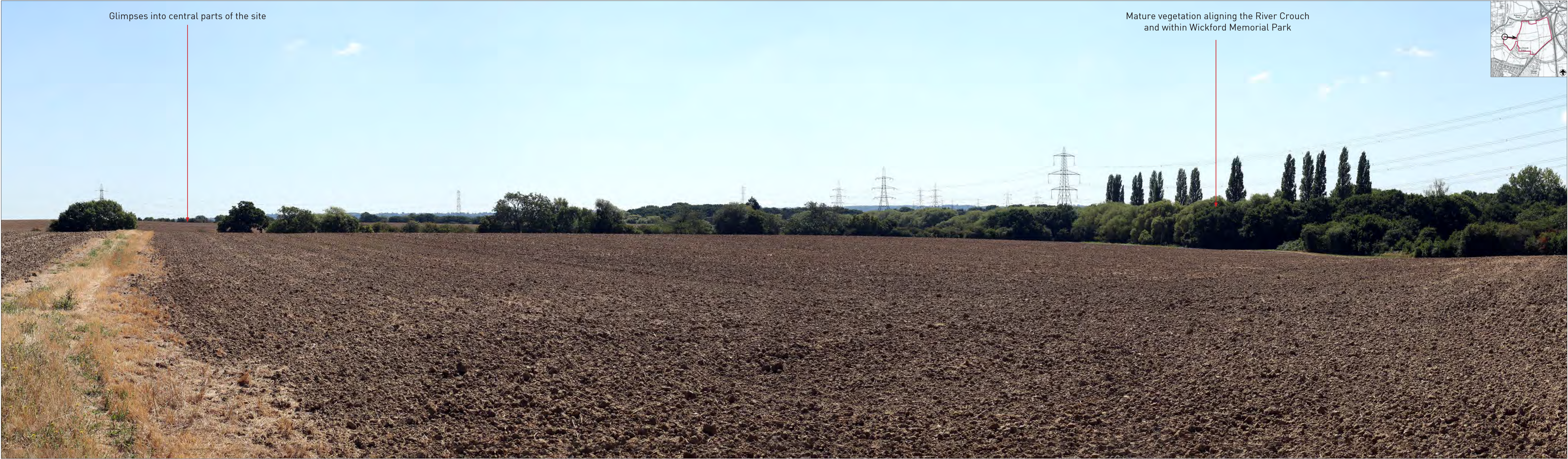
Glimpses into central parts of the site