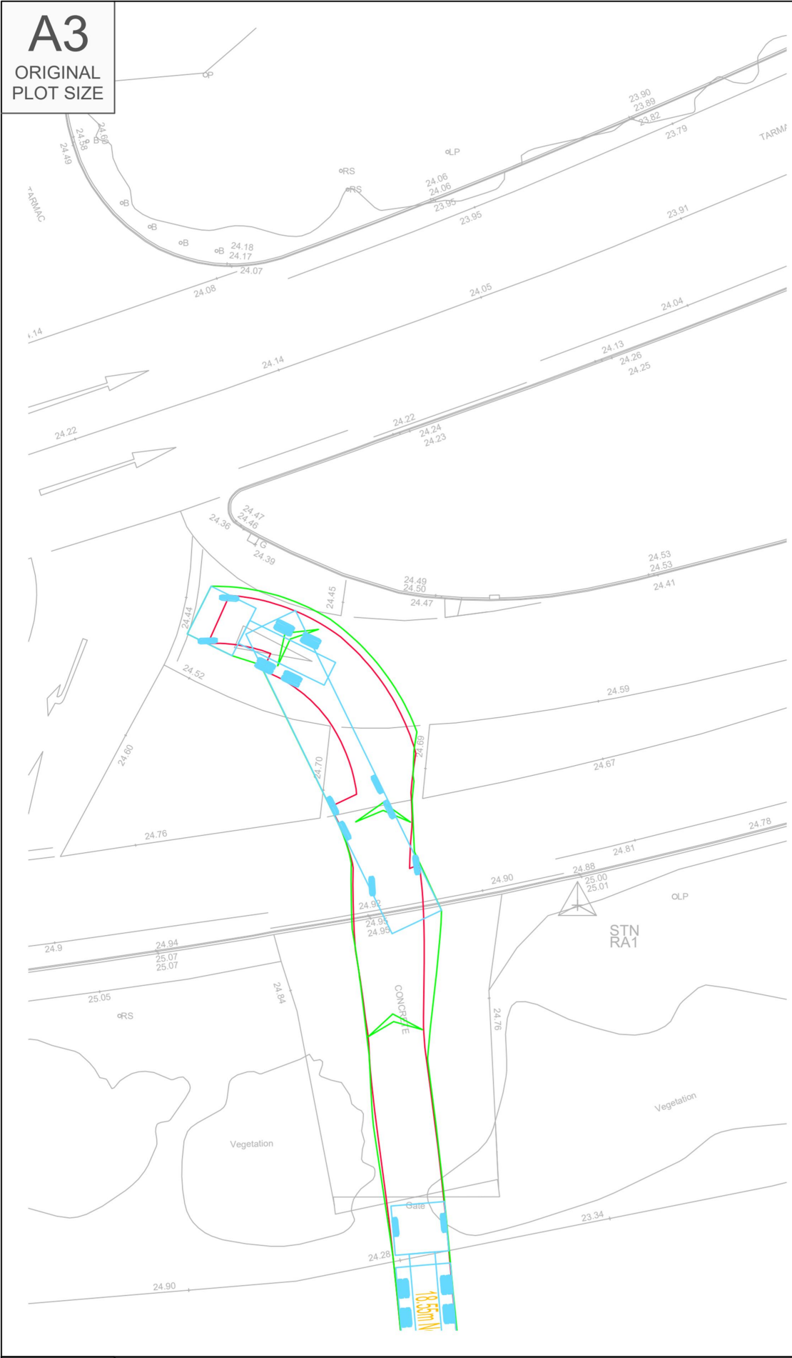
18.55m Longer Semi-trailer Turning Right Scale 1:250